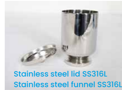
Stainless steel lid SS316L Stainless steel funnel SS316L