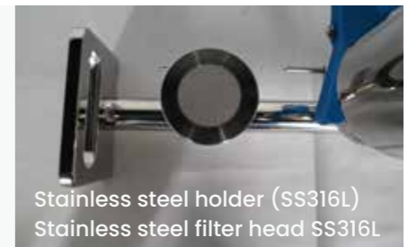
Stainless steel holder (SS316L) Stainless steel filter head SS316L

All the manifolds can be autoclaved at 121°C for 20-30 minutes or sterilized with epoxyethane etc.