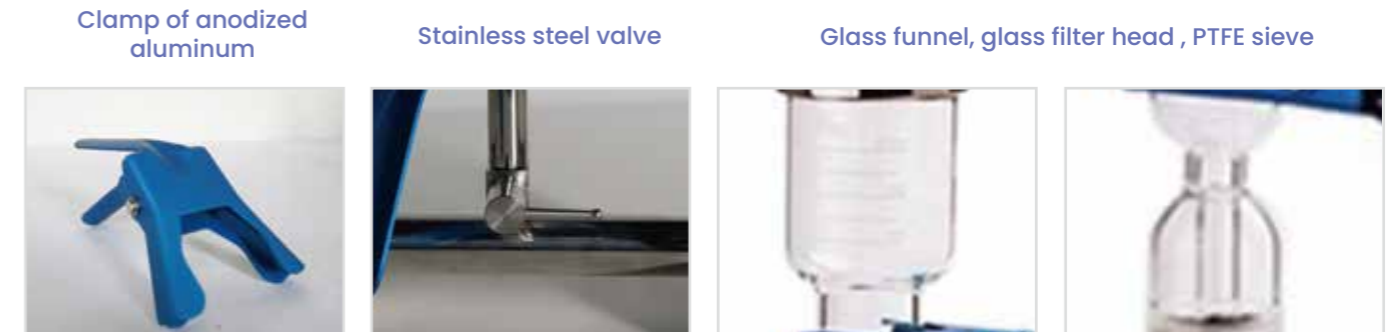
Clamp of anodized aluminum