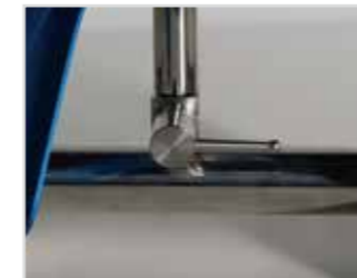
Stainless steel valve