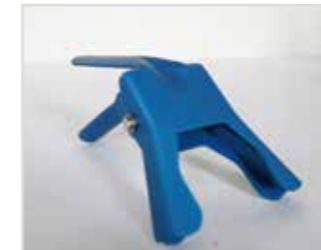
Clamp of anodized aluminum