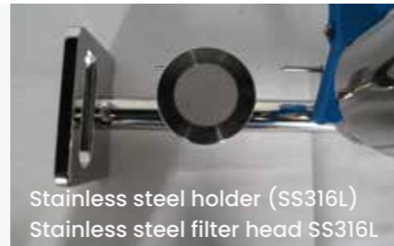
Stainless steel holder (SS316L) Stainless steel filter head SS316L

All the manifolds can be autoclaved at 121°C for 20-30 minutes or sterilized with epoxyethane etc.