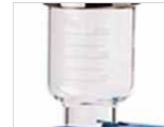
Glass funnel, glass filter head , PTFE sieve