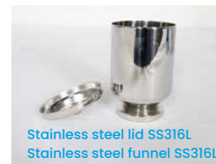
Stainless steel lid SS316L Stainless steel funnel SS316L