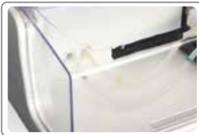
With washing function at the bottom of the microplate.