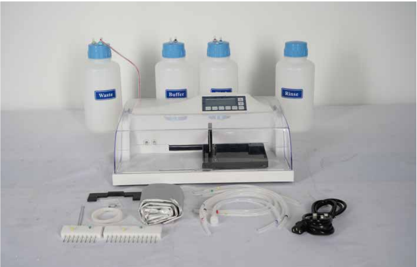
elisa Microplate Reader/elisa plate reader