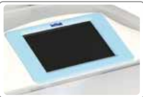
4.3-inch capacitive touch screen display, high touch sensitivity.

It is equipped with a liquid level sensor to avoid running out of wash solution or overflowing of waste liquid, and is suitable for flat-bottom, U-bottom, and V-bottom microplates.