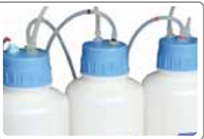
Supports dual point liquid suction, low residual volume.